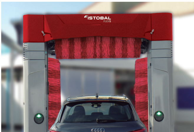
ISTOBAL FLEX5 with 3 brushes